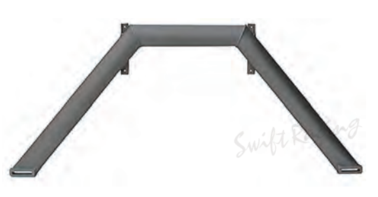
Rig29A-ha Scull wing rigger long block for adaptive boat - hard anodised Material: Aluminium Standard: 01/2013~