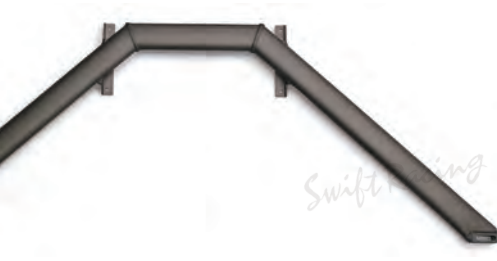
Rig29-ha Scull wing rigger - hard anodised Material: Aluminium Standard: 01/2013~

In January 2013 a new wing rigger was introduced, with better design, using backstays for scull and sweep for maximum performance. No pins or topstays included.